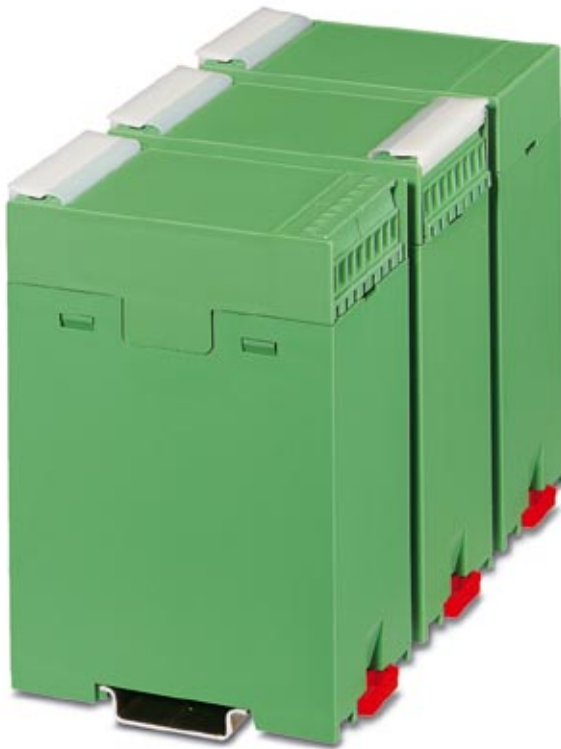
Housing cover, for connection on both sides

Illustration shows a fully mounted version of the electronic housing